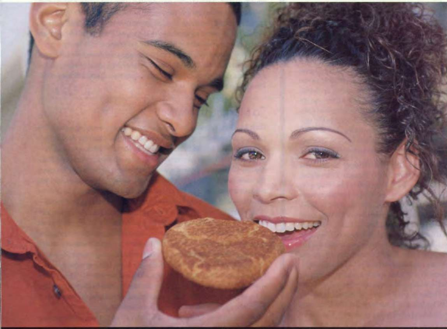
MAKEUP BY SHERRI MORRIS OF BRUSHWORK / MODELS COURTESY OF CAST IMAGES

Insiders’ note: All of the baked goods are made without butter, with vegetable shortening used as a substitute.